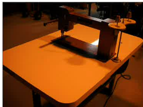
TABLE: 30"x48" work surface 30" off the ground.