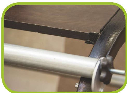
Consumer Supplied Conduit and Board