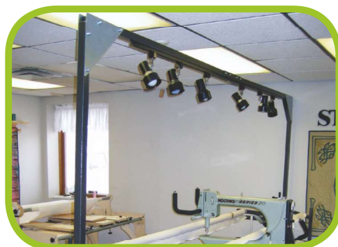
Steel Light Bar Available