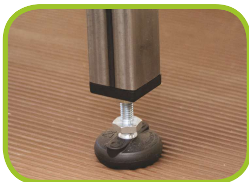
Center Leg Available