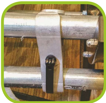
Fabric Roller Brake