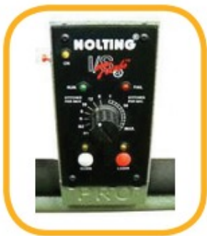
IS TURBO CL Stitch Regulator