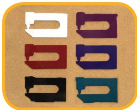
High Gloss Custom Paint Colors

Professional packages include machine, frame, needles, bobbins, bobbin winder, oil, patterns, clamps, leaders, product manuals, and 5-year warranty. Additionally, Nolting offers exceptional services such as delivery, package installations, and superior professional training.