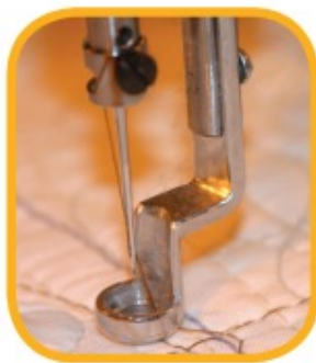
Round Foot For Ruler Guides