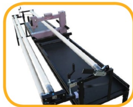
Nolting Commercial Steel Frame