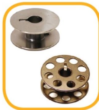
"L or M" bobbin